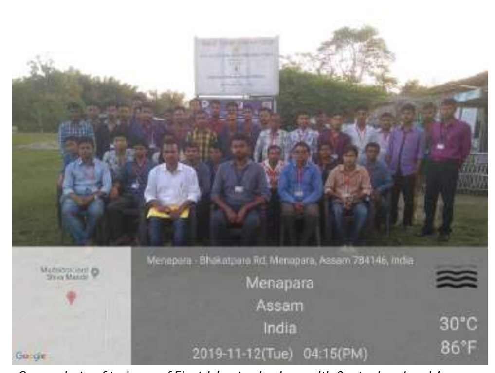
Group photo of trainees of Electrician trade along with Centre head and Assessor