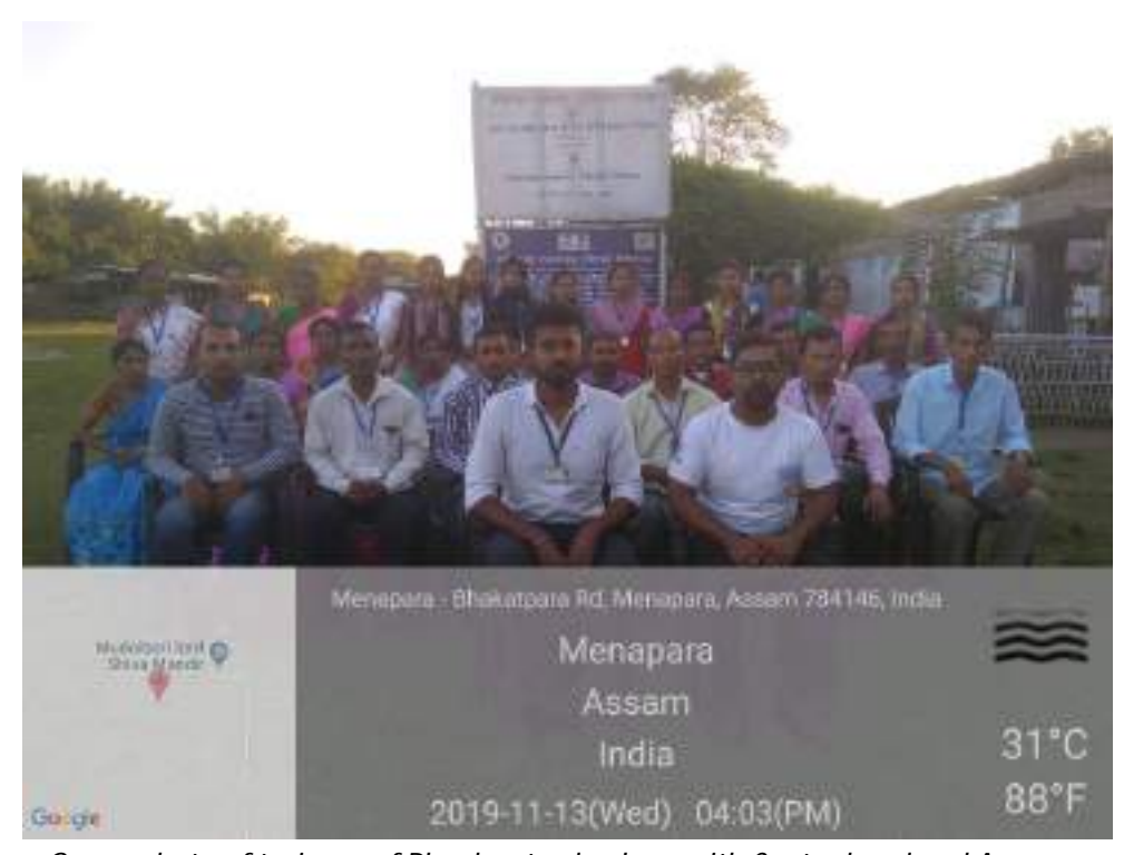
Group photo of trainees of Plumber trade along with Centre head and Assessor