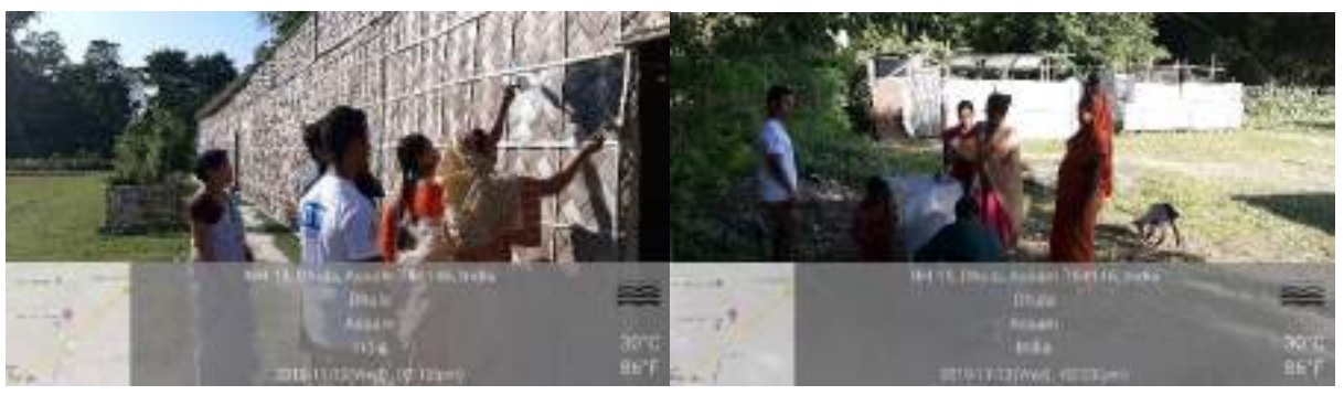
Practical Assessment of Painter trade