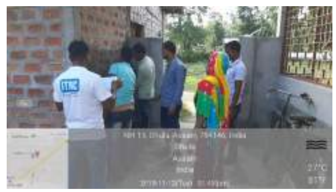
Practical Assessment of Mason trade