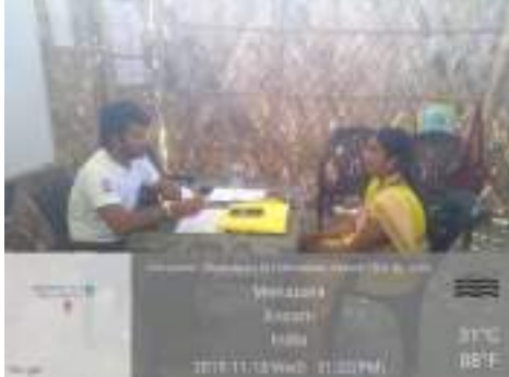
Viva Assessment of Mason trade