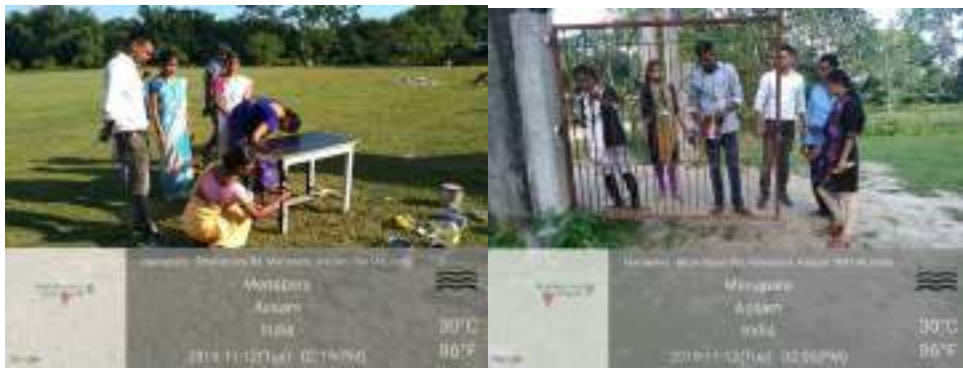
Practical Electrician of Painter trade