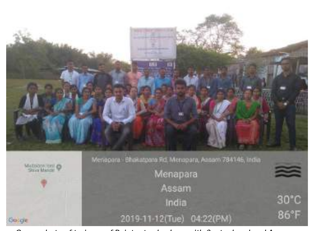
Group photo of trainees of Painter trade along with Centre head and Assessor