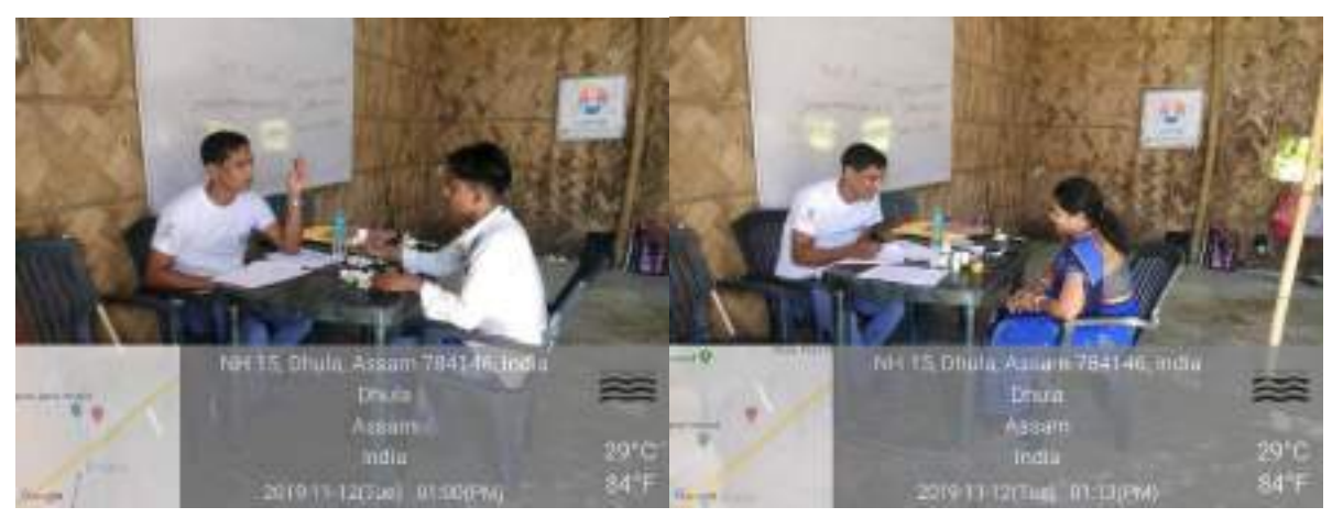
Viva Assessment of Plumber trade