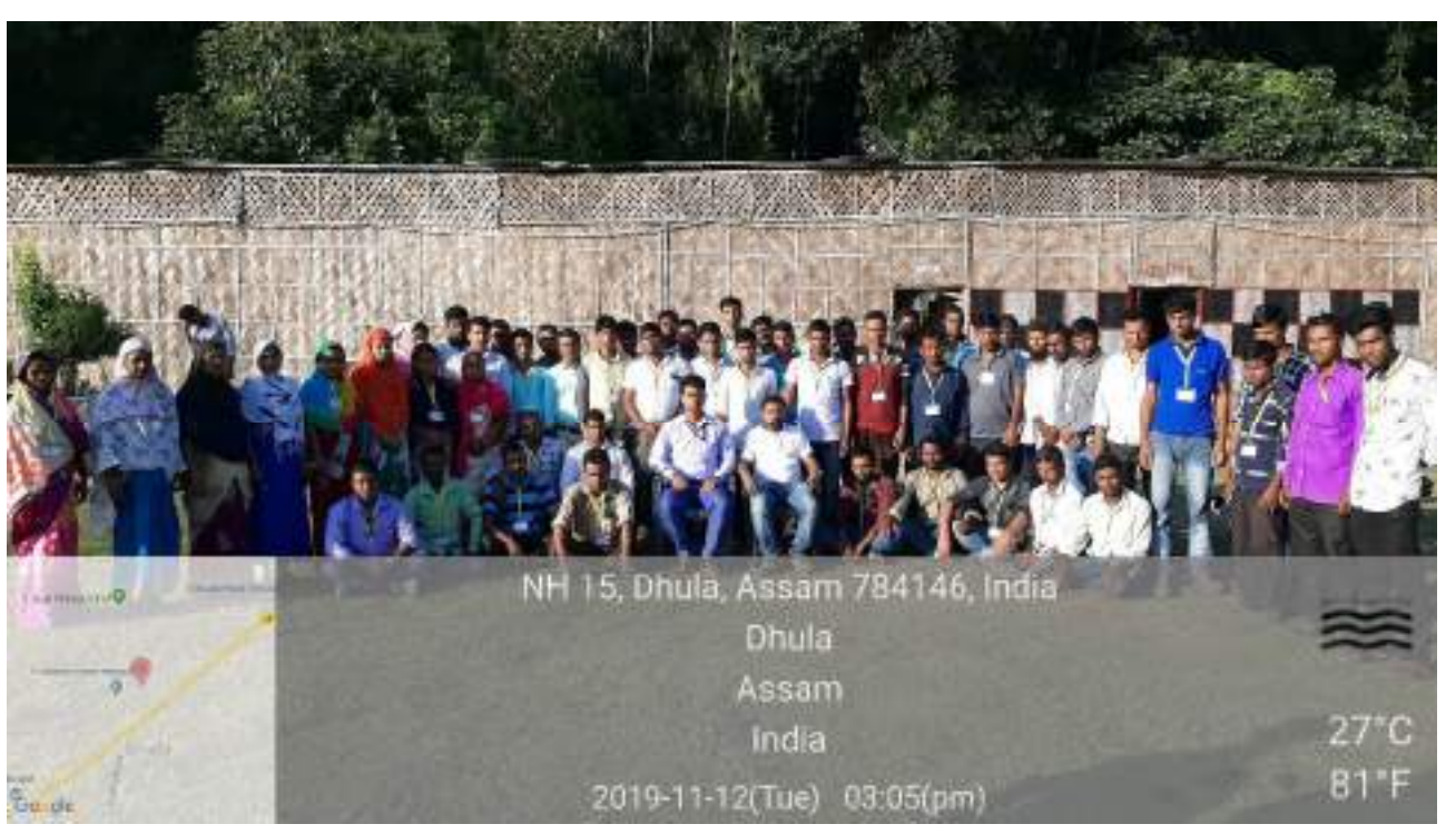
Group photo of trainees of Mason trade along with Centre head and Assessor