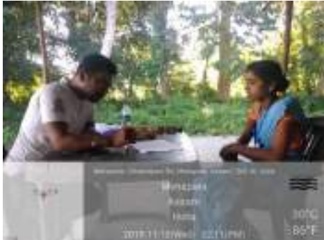
Viva Assessment of Plumber trade