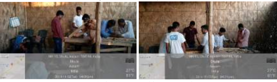
Practical Assessment of Carpentertrade