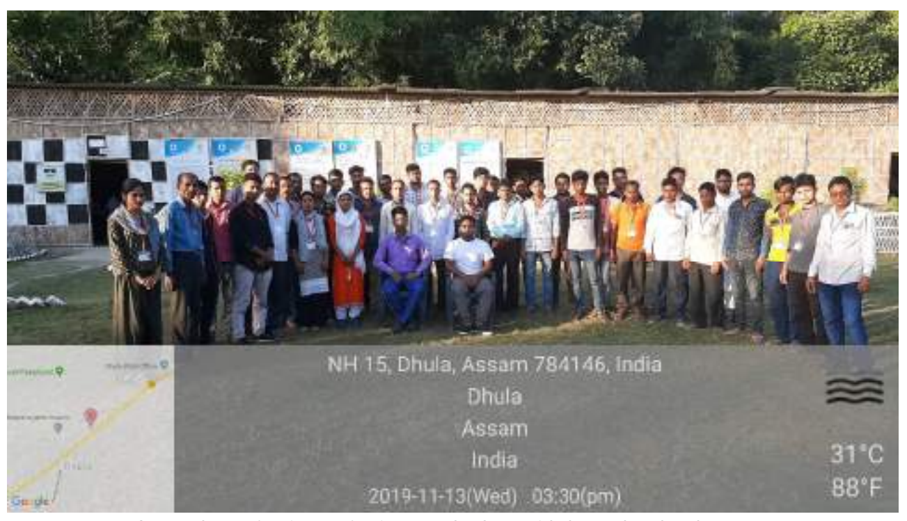
Group photo of trainees of Painter trade along with Centre head and Assessor