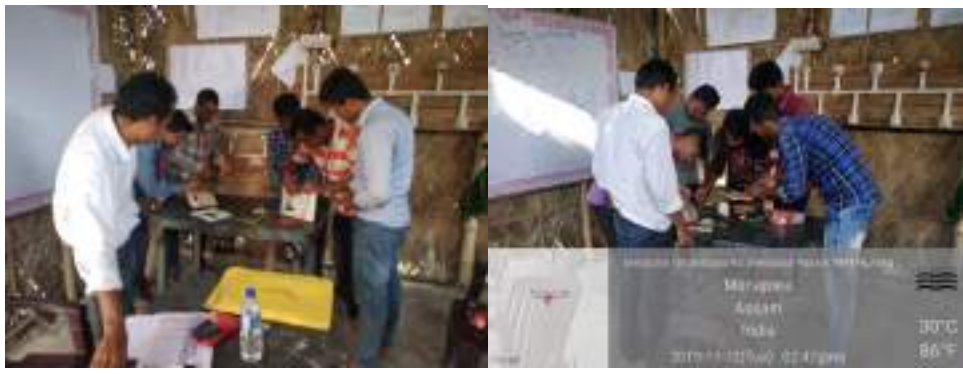
Practical Electrician of Electrician trade