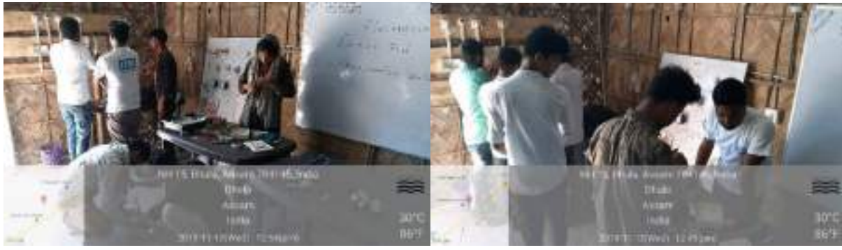
Practical Assessment of Electrician trade