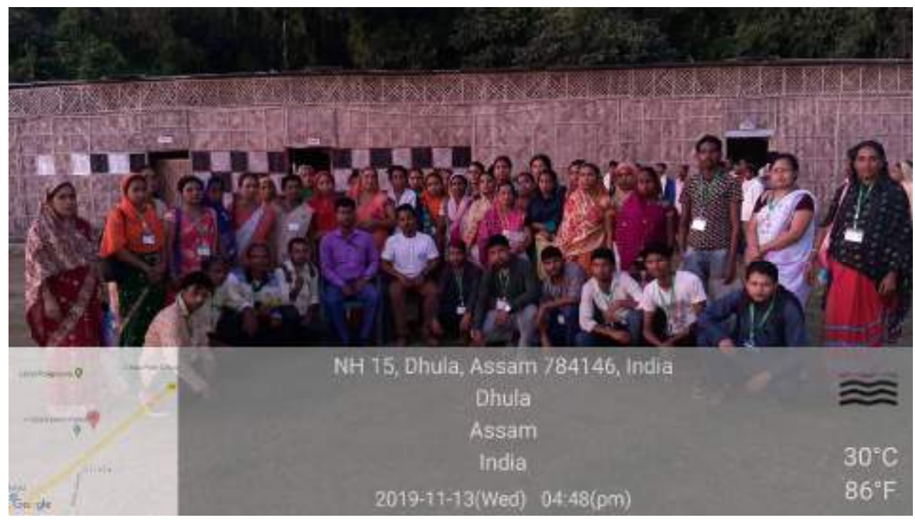
Group photo of trainees of Painter trade along with Centre head and Assessor