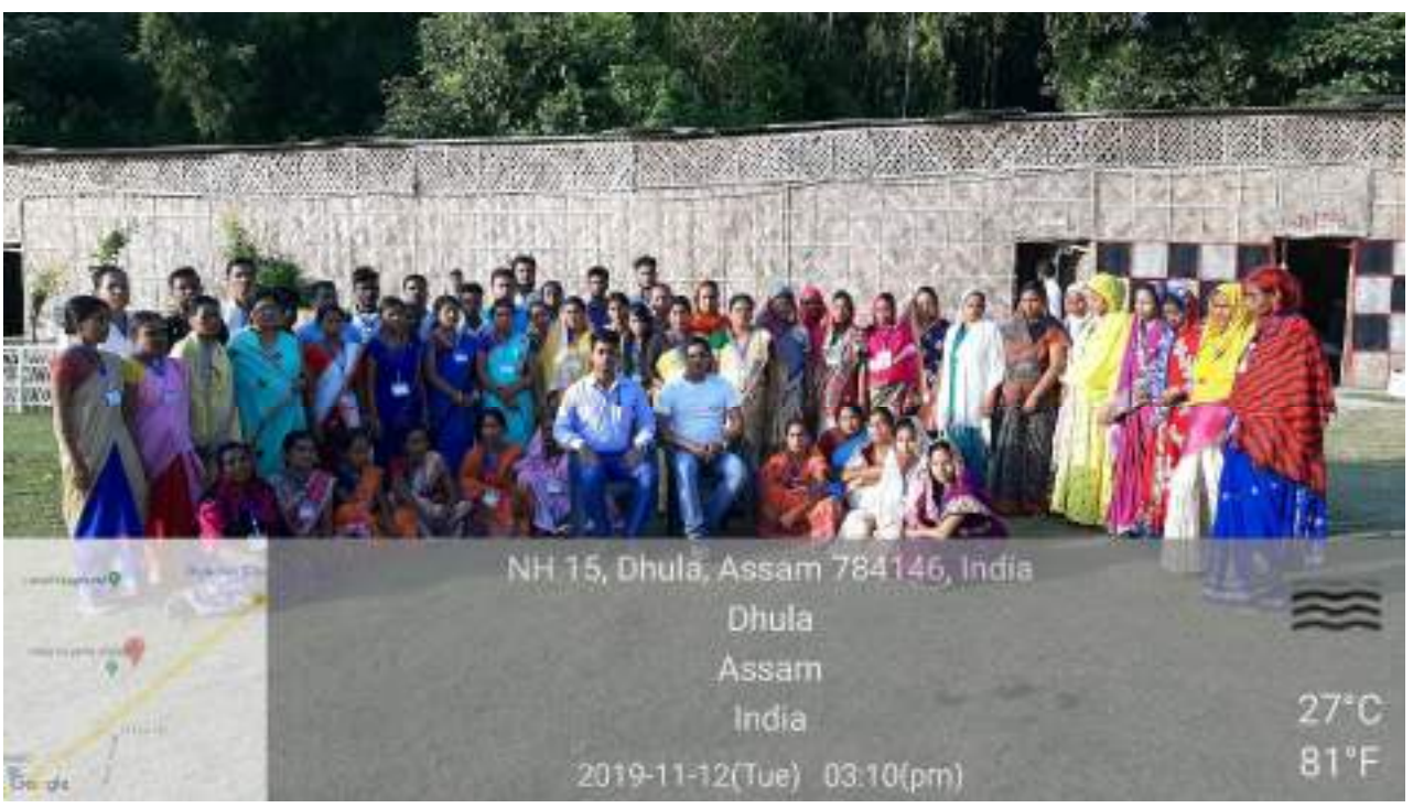
Group photo of trainees of Plumber trade along with Centre head and Assessor