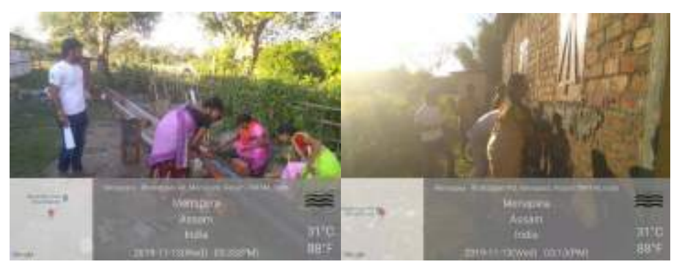
Practical Electrician of Mason trade