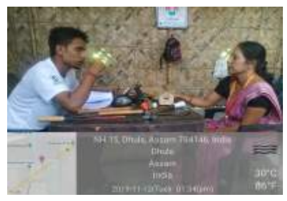
Viva Assessment of Carpenter trade