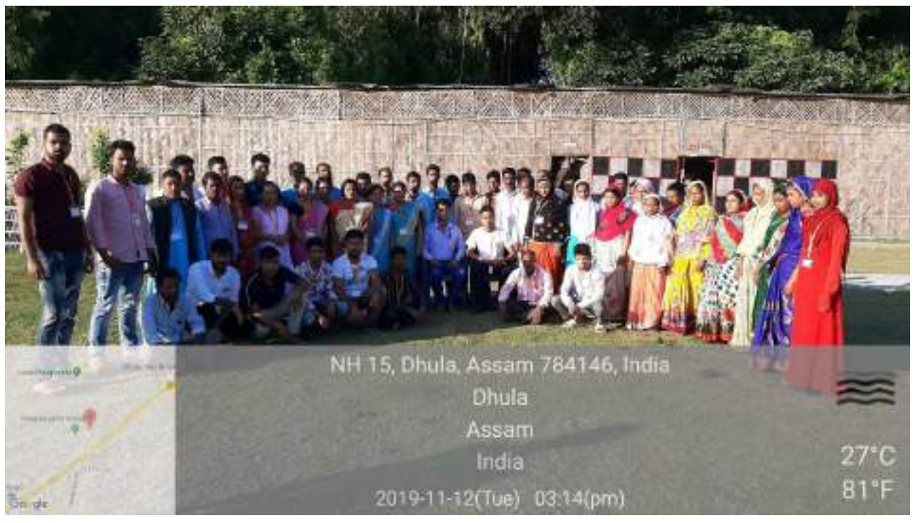
Group photo of trainees of Carpenter trade along with Centre head and Assessor