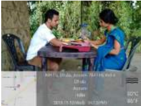
Viva Assessment of Painter trade