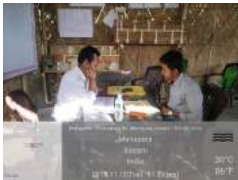
Viva Assessment of Electrician trade