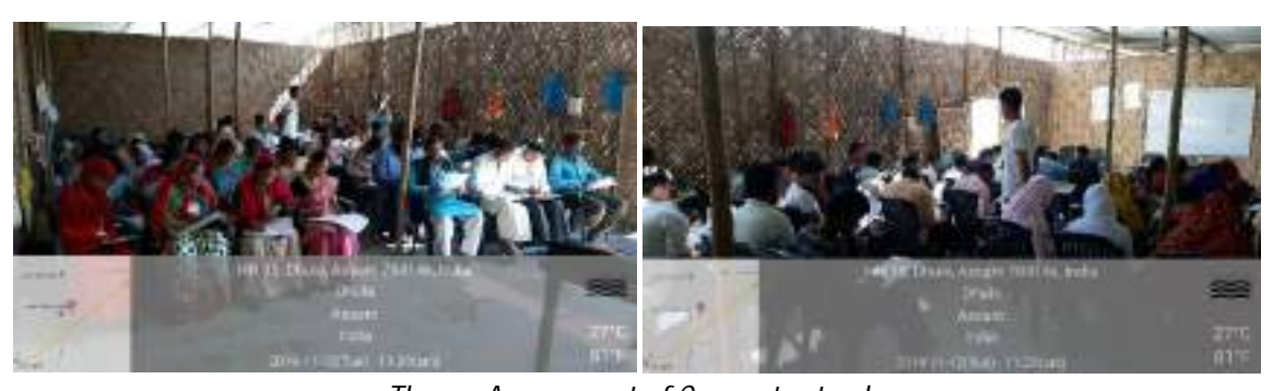
Theory Assessment of Carpenter trade