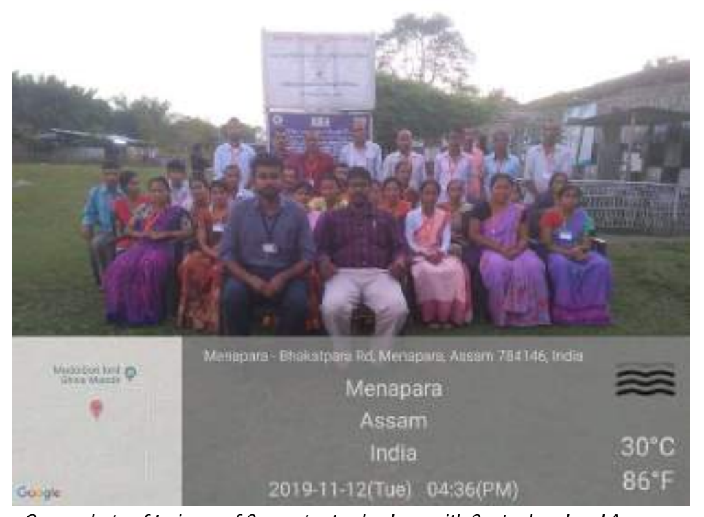
Group photo of trainees of Carpenter trade along with Centre head and Assessor