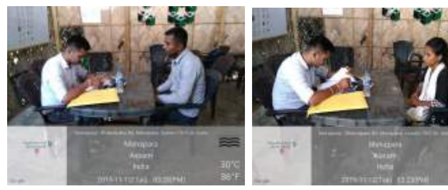
Viva Assessment of Painter trade