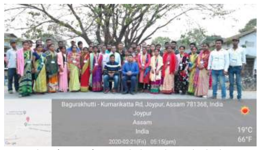
Group photo of trainees of Mason trade along with Centre head and Assessor