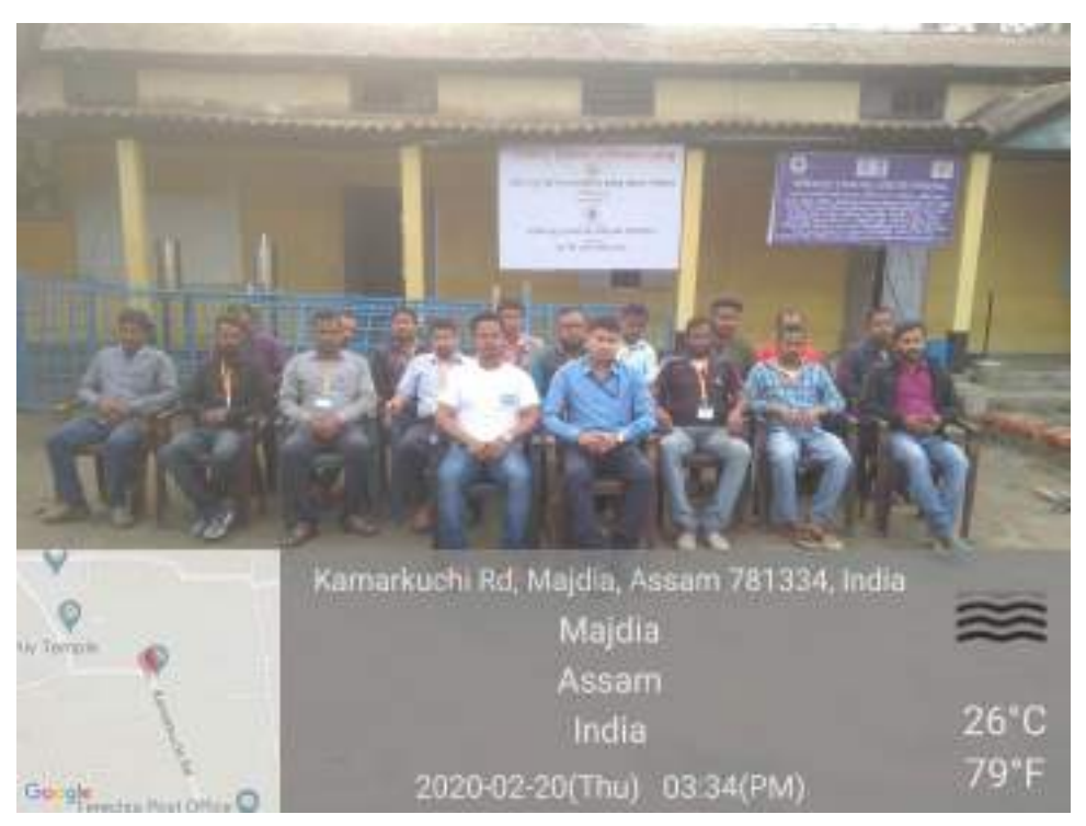
Group photo of trainees of Painter trade along with Centre head and Assessor