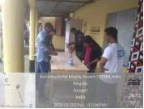
Practical Assessment of Painter trade