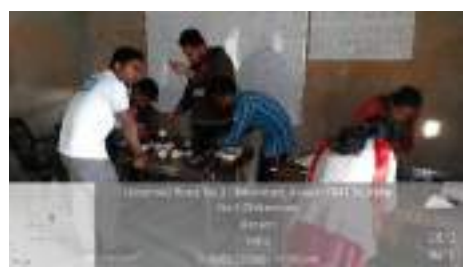
Practical Assessment of Electrician trade