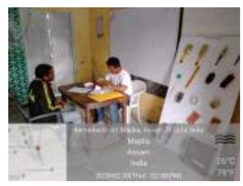
Viva Assessment of Painter trade