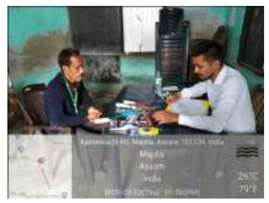
Viva Assessment of Carpenter trade