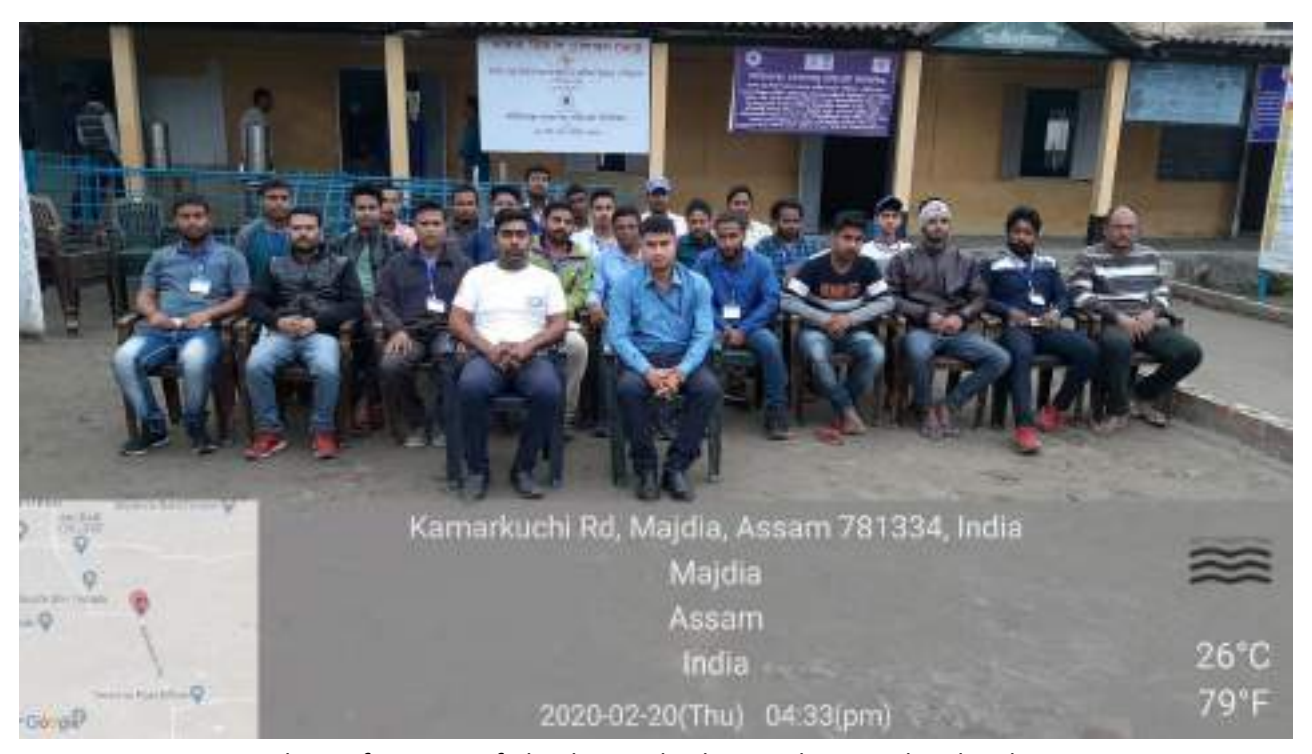
Group photo of trainees of Plumber trade along with Centre head and Assessor