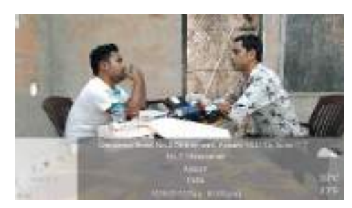
Viva Assessment of Electrician trade