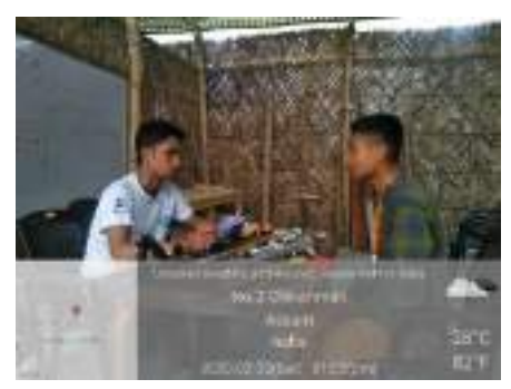
Viva Assessment of Carpenter trade