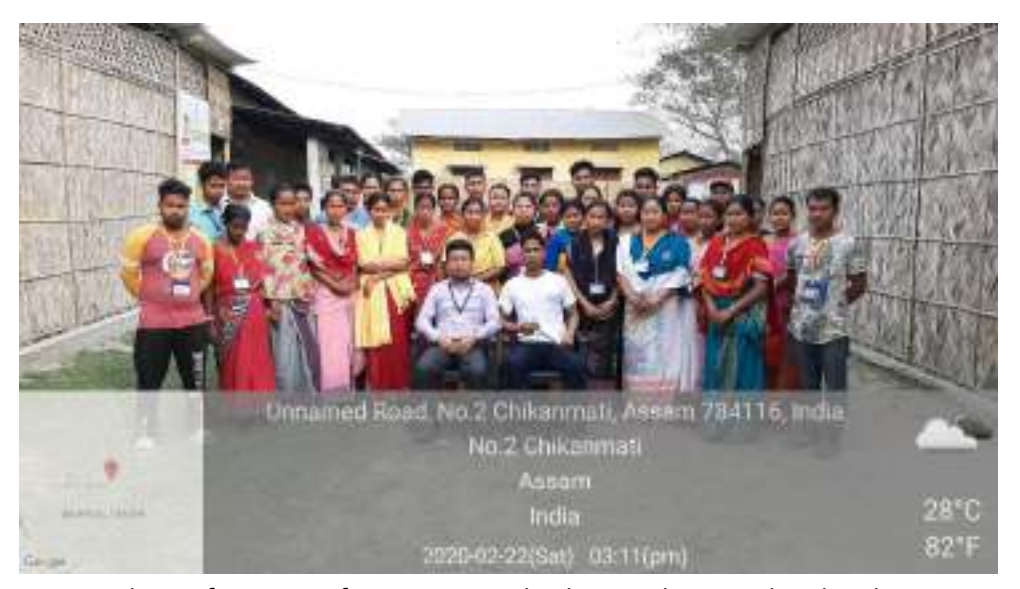
Group photo of trainees of Carpenter trade along with Centre head and Assessor