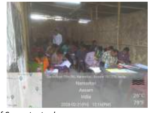
Theory Assessment of Carpenter trade