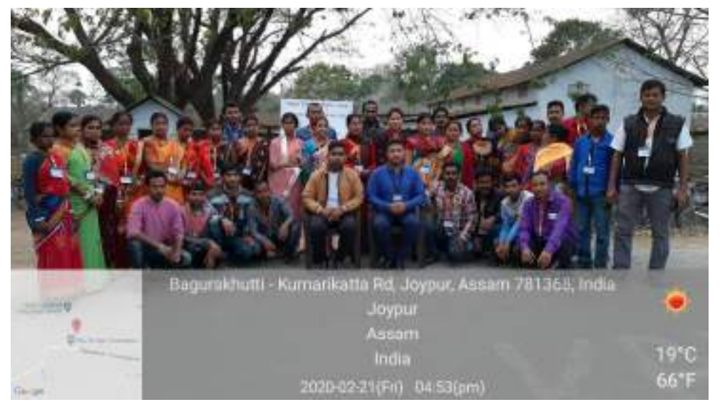
Group photo of trainees of Carpenter trade along with Centre head and Assessor