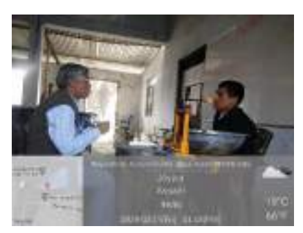
Viva Assessment of Plumber trade