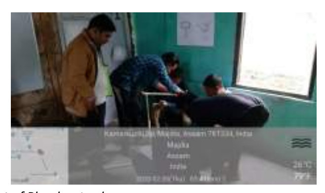
Practical Assessment of Plumber trade