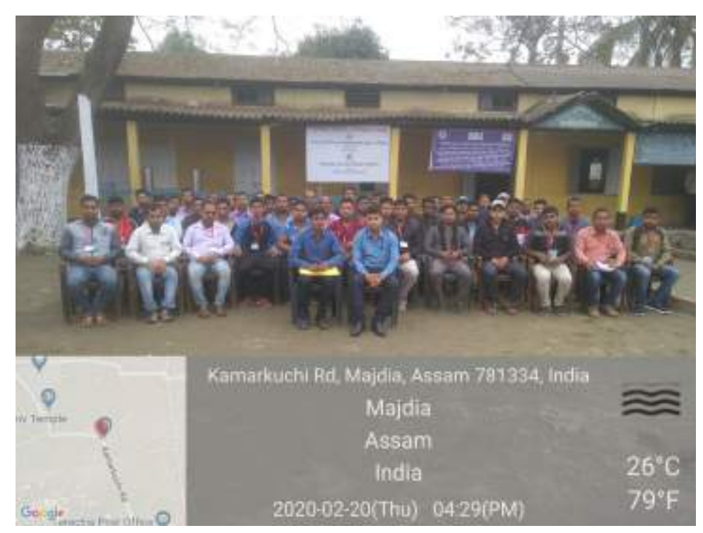
Group photo of trainees of Electrician trade along with Centre head and Assessor