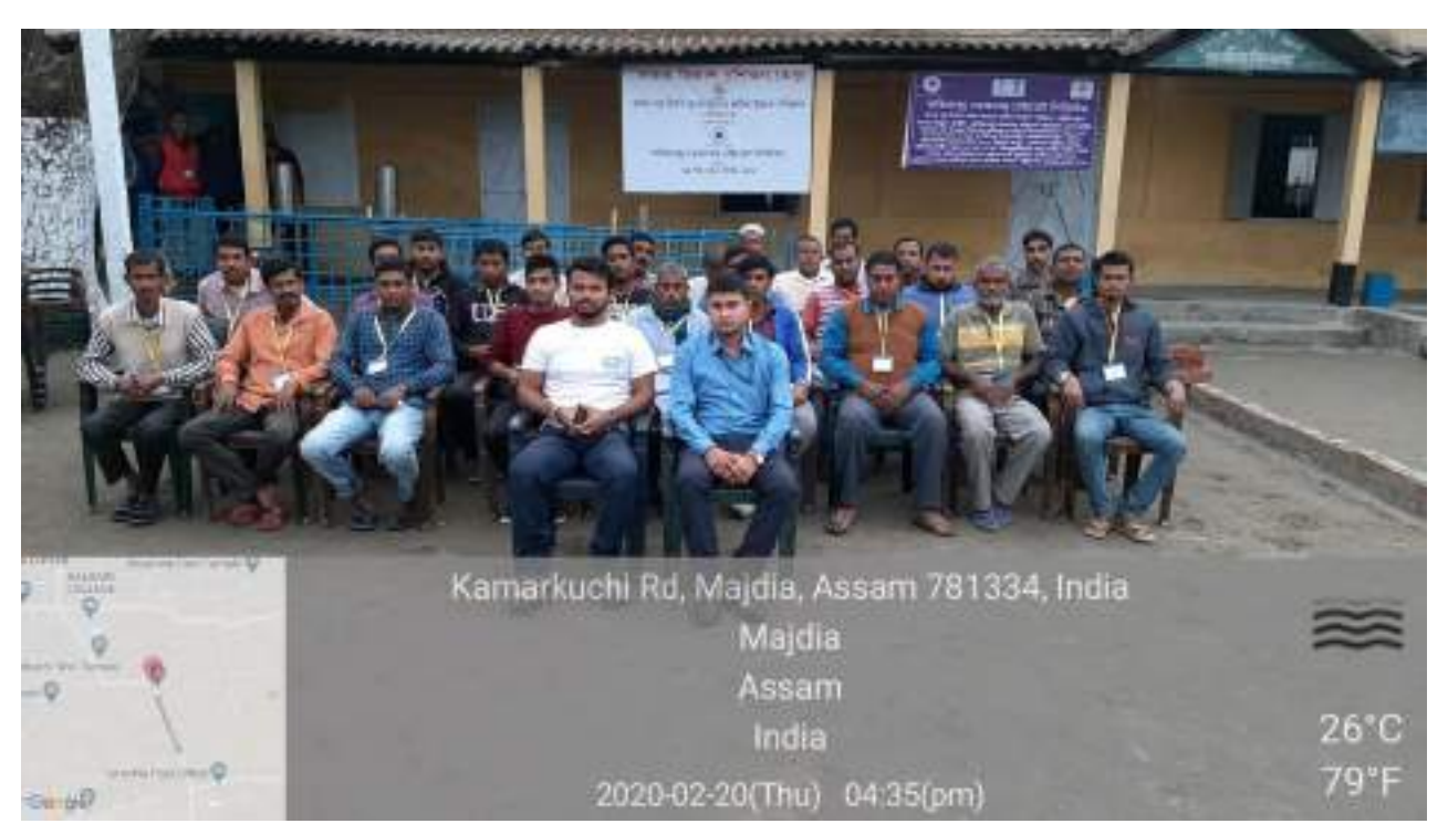
Group photo of trainees of Mason trade along with Centre head and Assessor