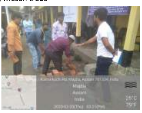
Practical Assessment of Mason trade