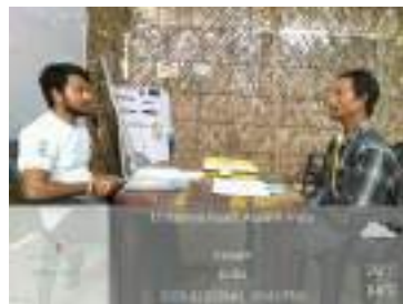
Viva Assessment of Mason trade