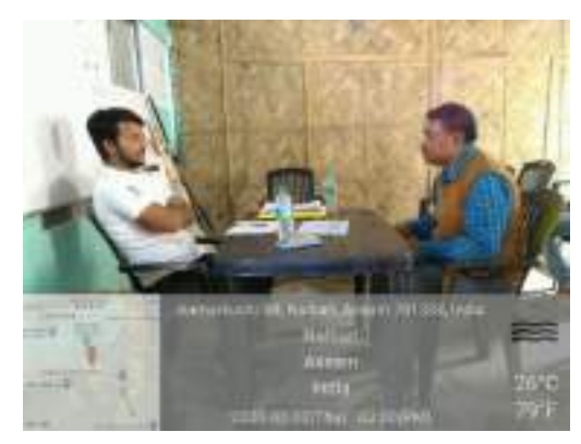
Viva Assessment of Mason trade