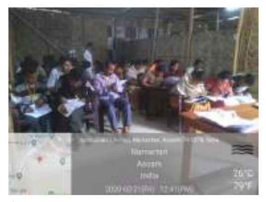
Theory Assessment of Painter trade