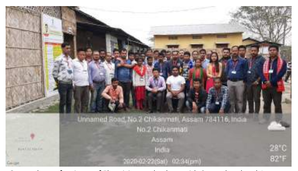
Group photo of trainees of Electrician trade along with Centre head and Assessor