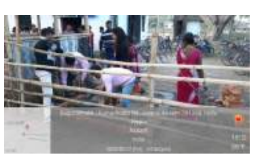
Practical Assessment of Mason trade