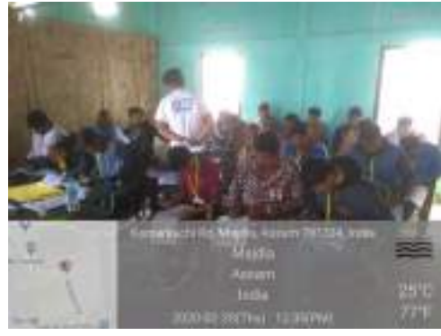
Theory Assessment of Mason trade