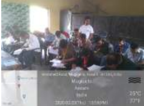
Theory Assessment of Painter trade