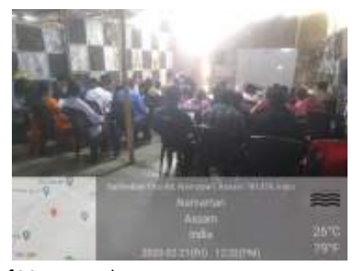
Theory Assessment of Mason trade