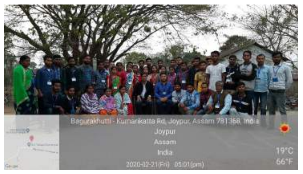
Group photo of trainees of Plumber trade along with Centre head and Assessor