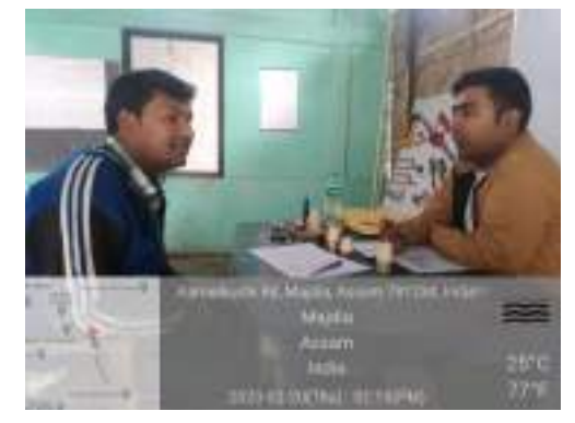
Viva Assessment of Plumber trade