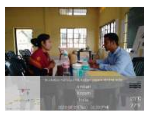
Viva Assessment of Painter trade