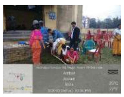
Practical Assessment of Plumber trade