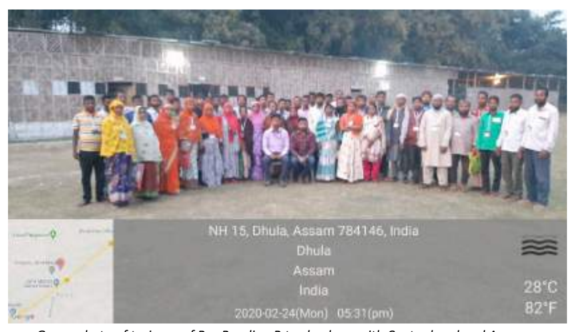
Group photo of trainees of Bar Bending B trade along with Centre head and Assessor