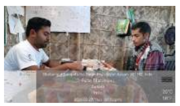
Viva Assessment of Electrician trade