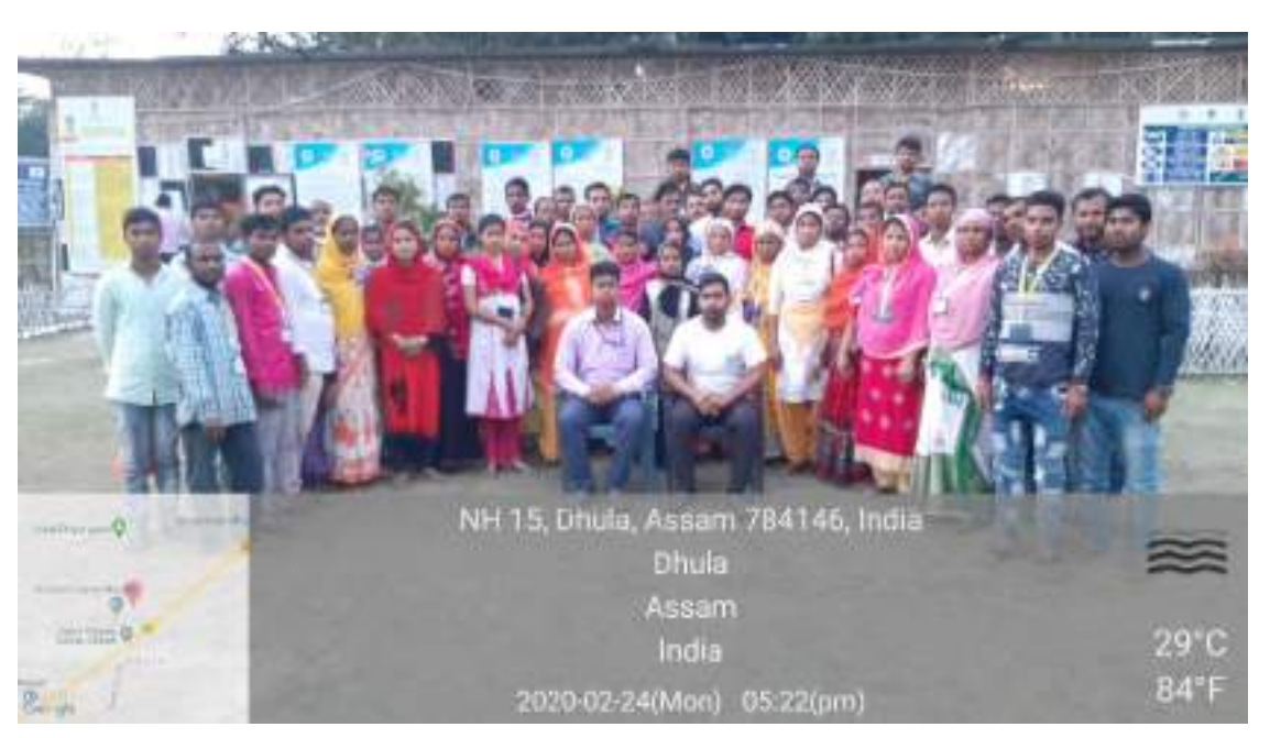
Group photo of trainees of Mason trade along with Centre head and Assessor