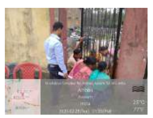
Practical Assessment of Painter trade