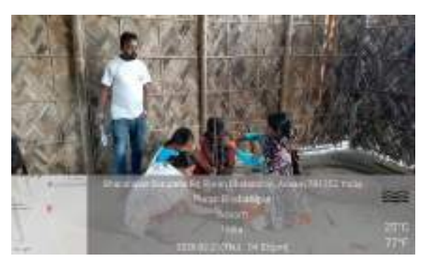
Practical Assessment of Bar Bending A trade