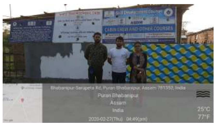
Diganta Kalita with Assistant and SPOC of the training centre with name of board of the training centre in the background