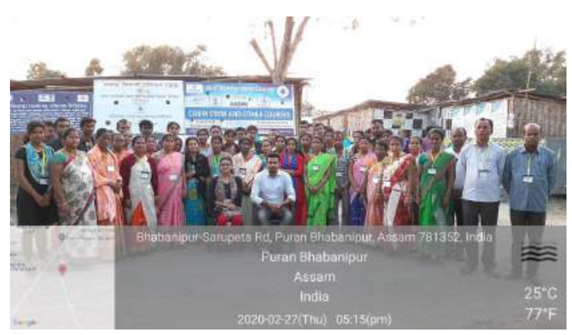
Group photo of trainees of Mason trade along with Centre head and Assessor