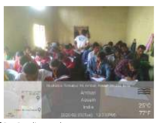
Theory Assessment of Bar Bending trade