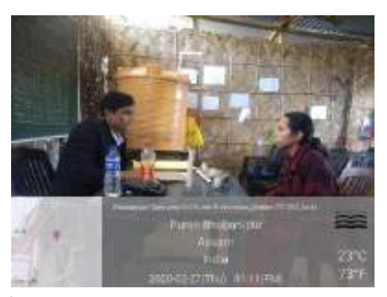
Viva Assessment of Plumber trade