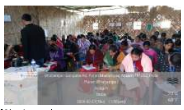
Theory Assessment of Plumber trade