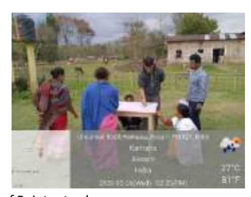
Practical Assessment of Painter trade