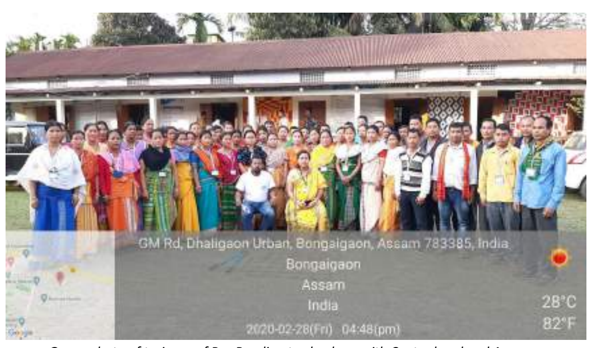
Group photo of trainees of Bar Bending trade along with Centre head and Assessor