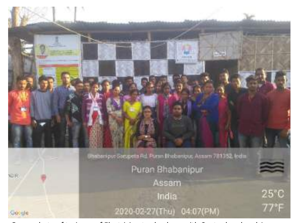
Group photo of trainees of Electrician trade along with Centre head and Assessor