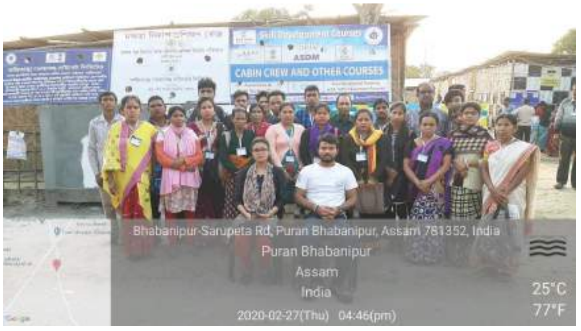
Group photo of trainees of Bar Bending B trade along with Centre head and Assessor