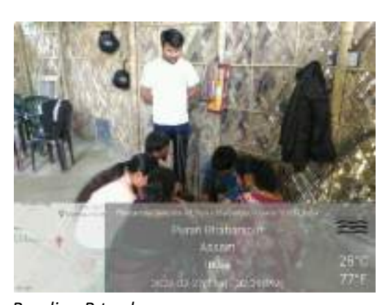
Practical Assessment of Bar Bending B trade