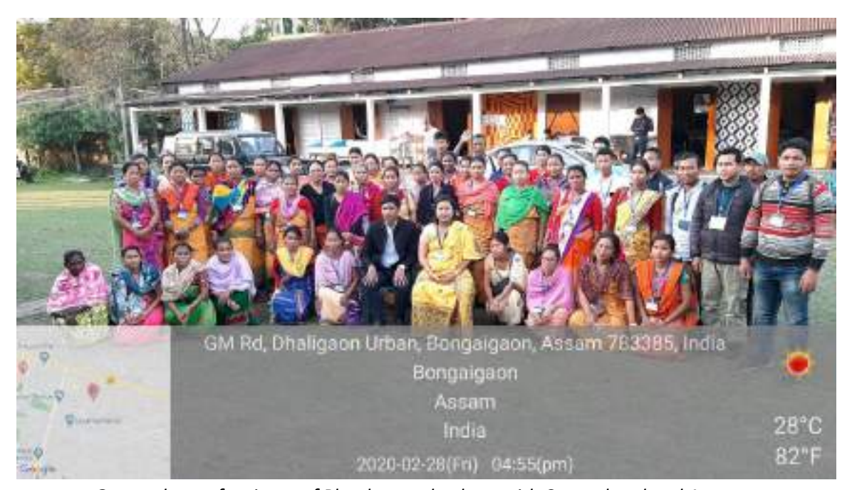
Group photo of trainees of Plumber trade along with Centre head and Assessor