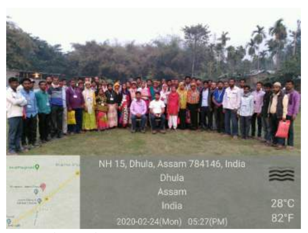
Group photo of trainees of Bar Bending A trade along with Centre head and Assessor