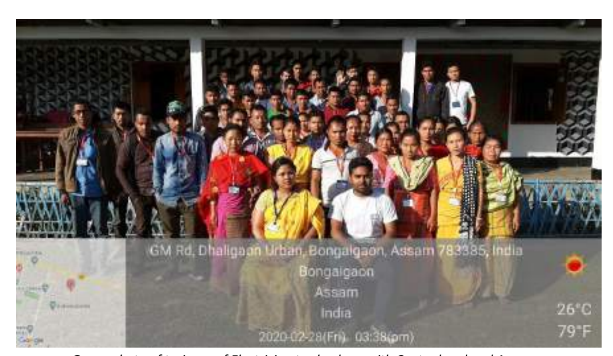
Group photo of trainees of Electrician trade along with Centre head and Assessor