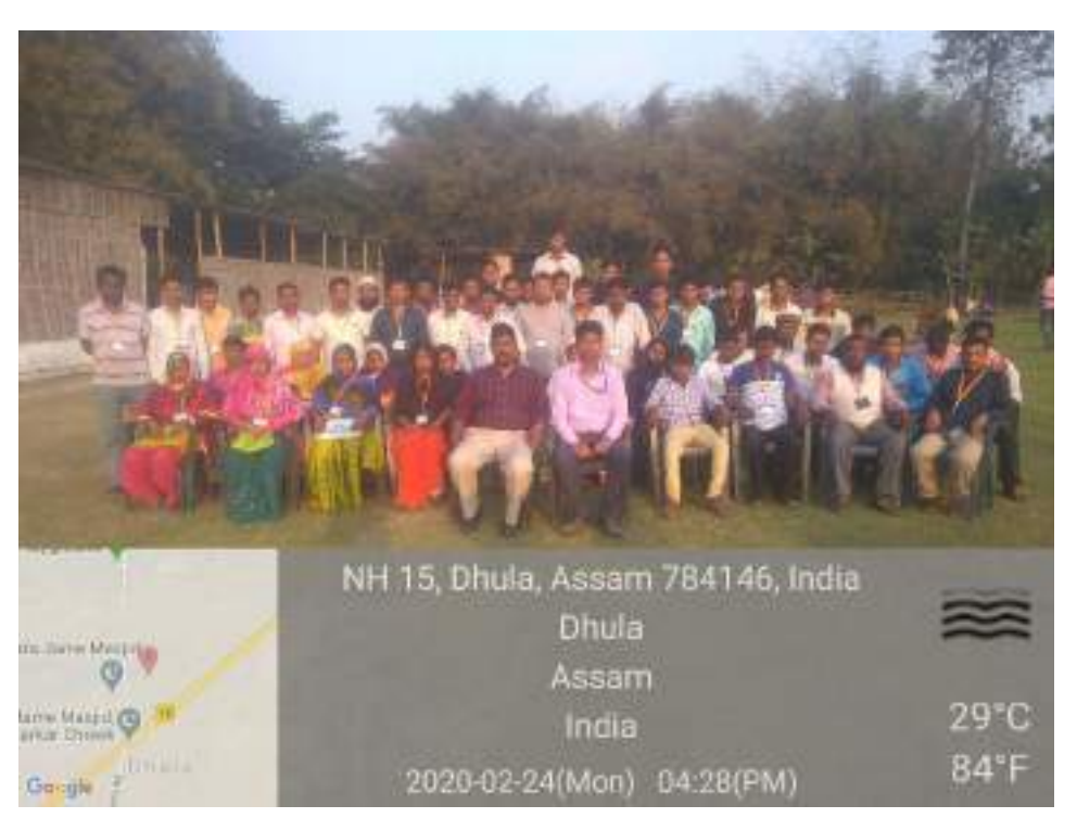
Group photo of trainees of Carpenter trade along with Centre head and Assessor