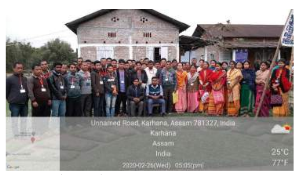
Group photo of trainees of Electrician trade along with Centre head and Assessor