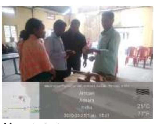
Practical Assessment of Carpenter trade