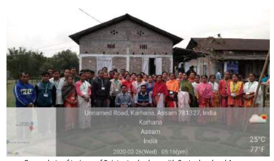
Group photo of trainees of Painter trade along with Centre head and Assessor