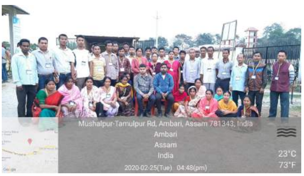
Group photo of trainees of Carpenter trade along with Centre head and Assessor