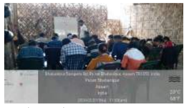
Theory Assessment of Bar Bending B trade