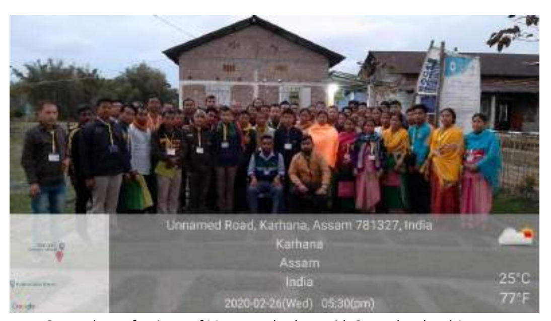
Group photo of trainees of Mason trade along with Centre head and Assessor