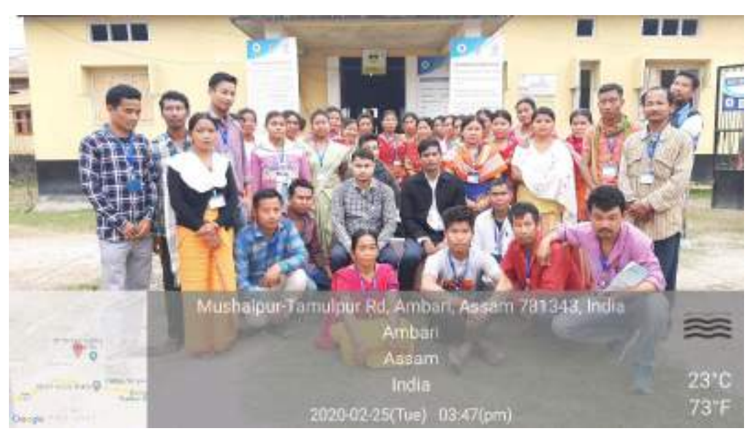
Group photo of trainees of Plumber trade along with Centre head and Assessor