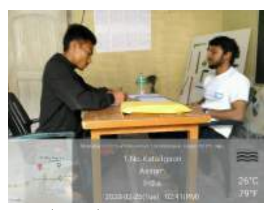
Viva Assessment of Bar Bending trade