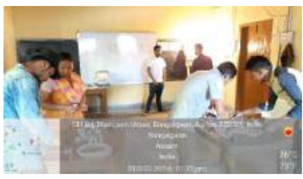
Practical Assessment of Electrician trade