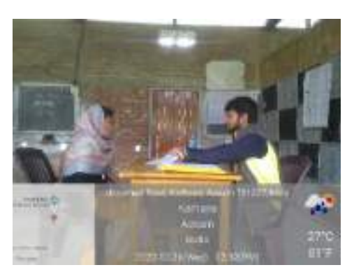
Viva Assessment of Bar Bending trade