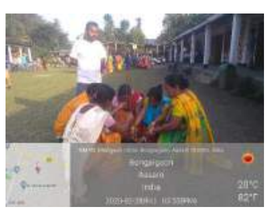
Practical Assessment of Bar Bending trade