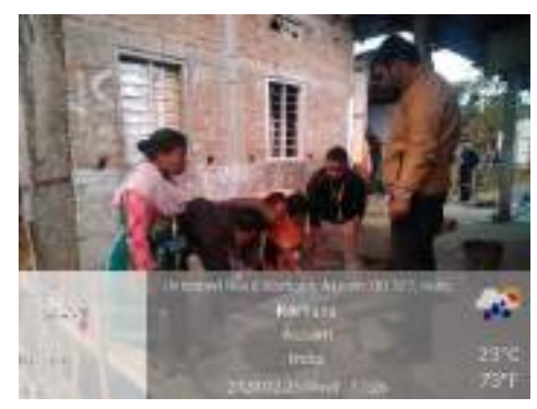
Practical Assessment of Mason trade