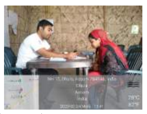
Viva Assessment of Mason trade