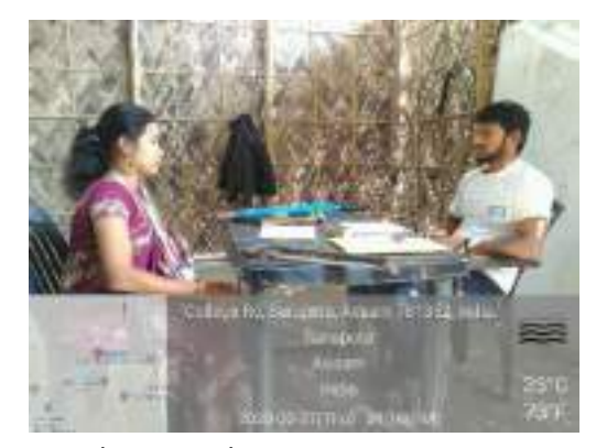
Viva Assessment of Bar Bending B trade