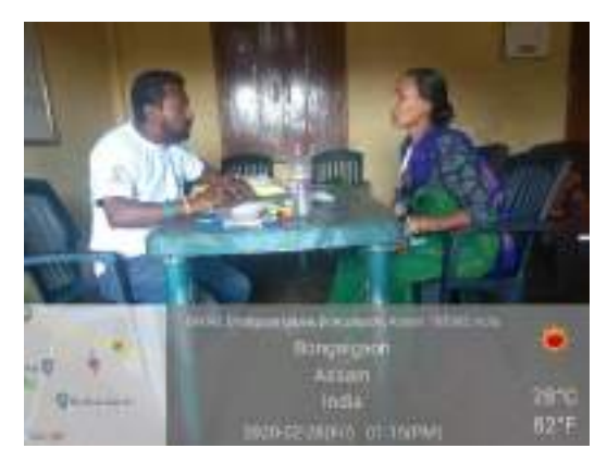
Viva Assessment of Bar Bending trade