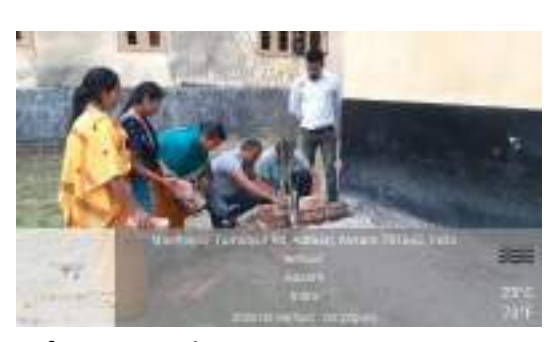
Practical Assessment of Mason trade