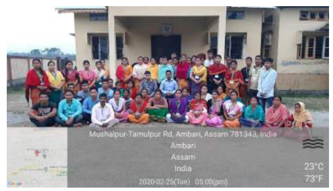
Group photo of trainees of Painter trade along with Centre head and Assessor