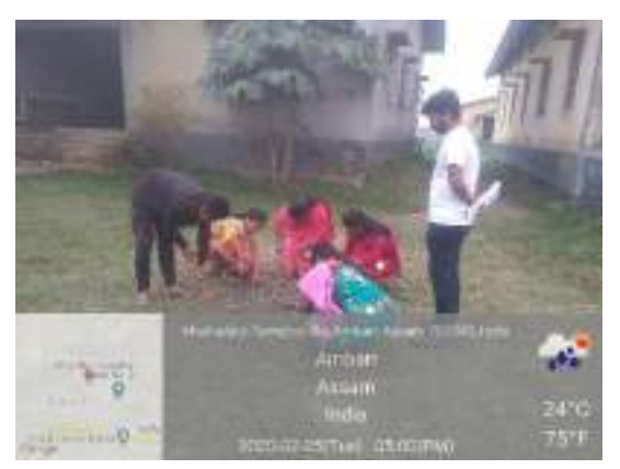
Practical Assessment of Bar Bending trade