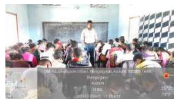
Theory Assessment of Carpenter trade