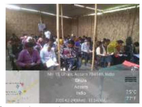
Theory Assessment of Bar Bending A trade