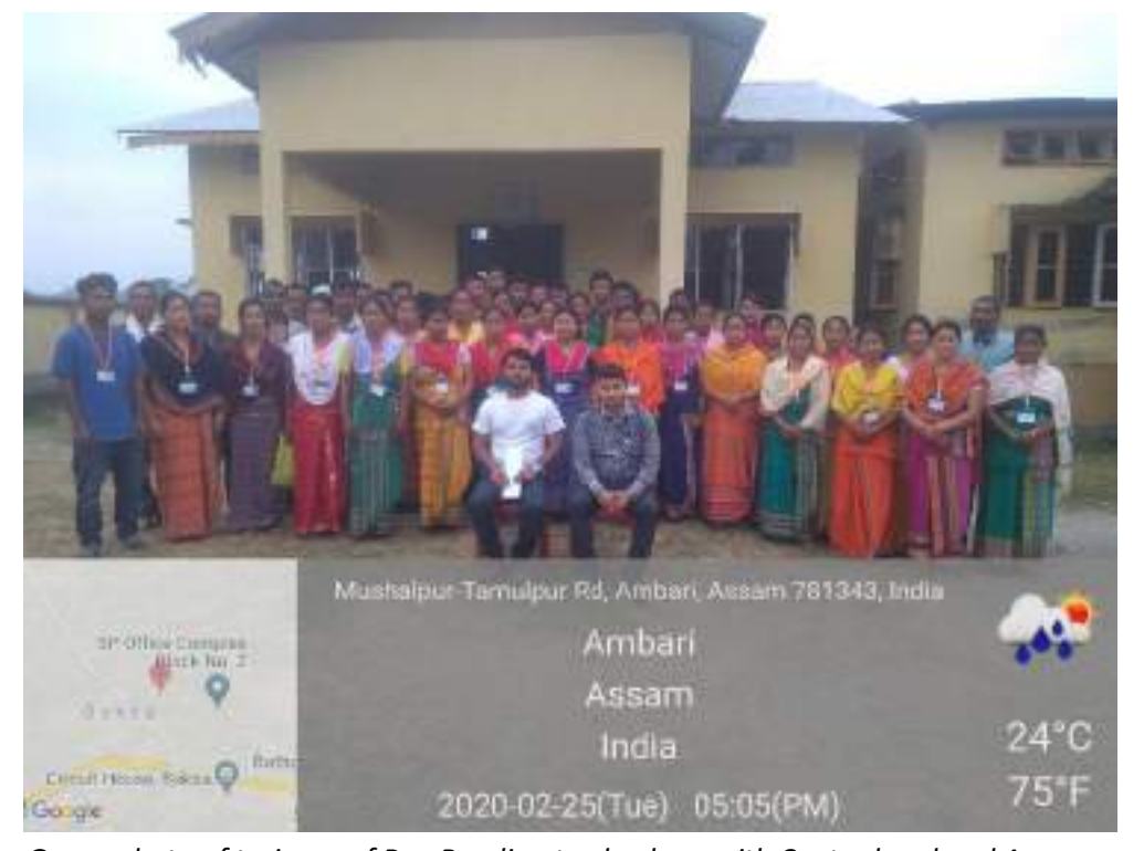
Group photo of trainees of Bae Bending trade along with Centre head and Assessor