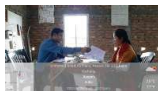
Viva Assessment of Electrician trade