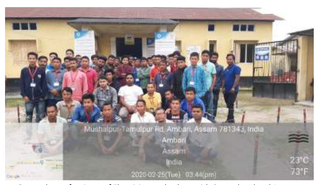
Group photo of trainees of Electrician trade along with Centre head and Assessor