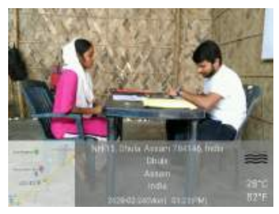
Viva Assessment of Bar Bending A trade