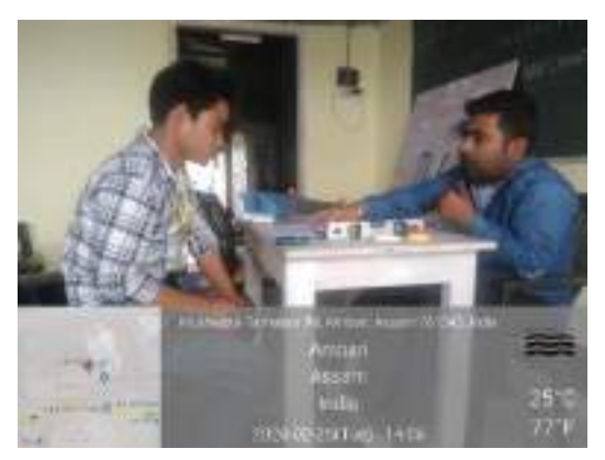
Viva Assessment of Carpenter trade