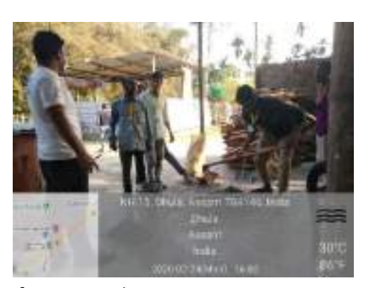
Practical Assessment of Mason trade