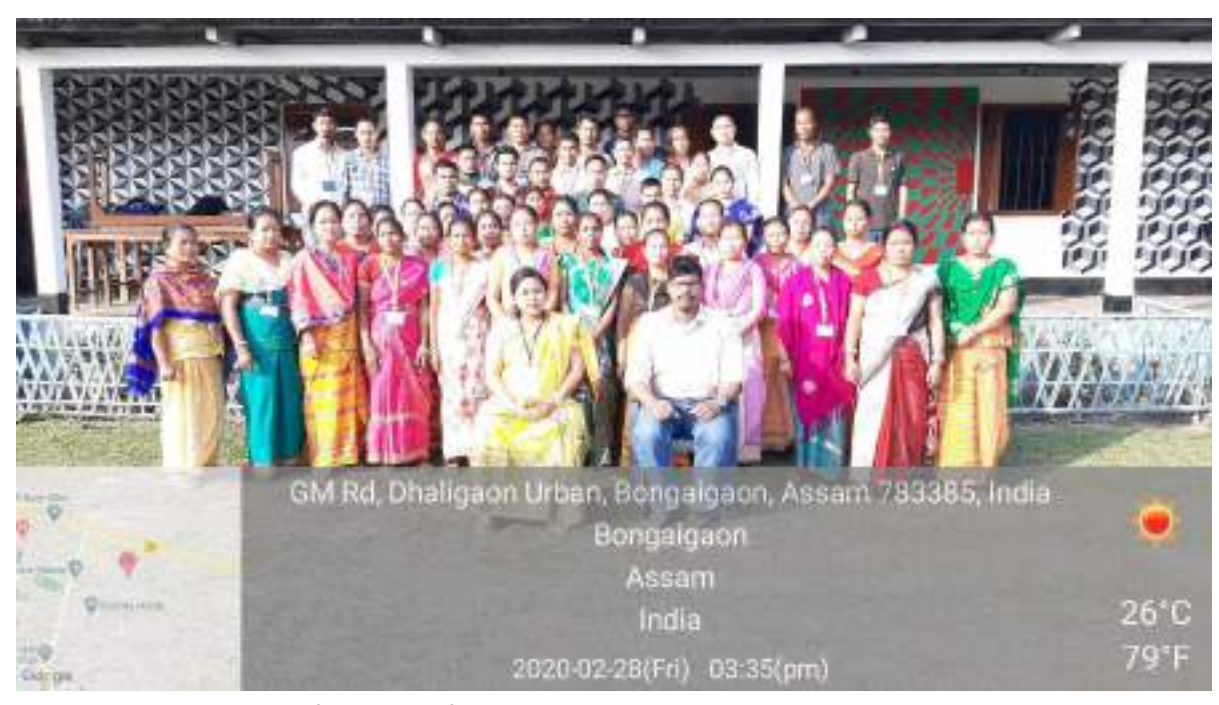
Group photo of trainees of Carpenter trade along with Centre head and Assessor