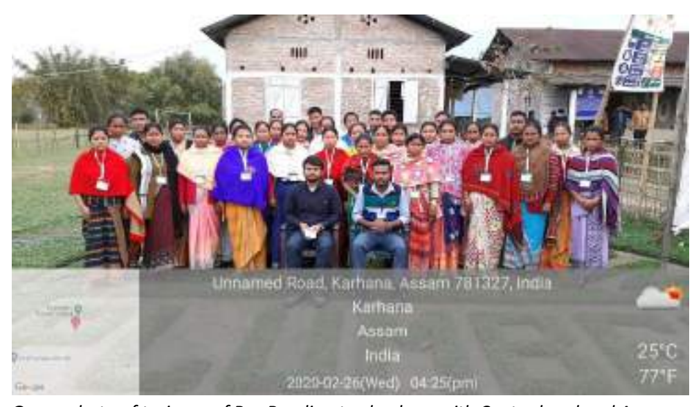
Group photo of trainees of Bar Bending trade along with Centre head and Assessor