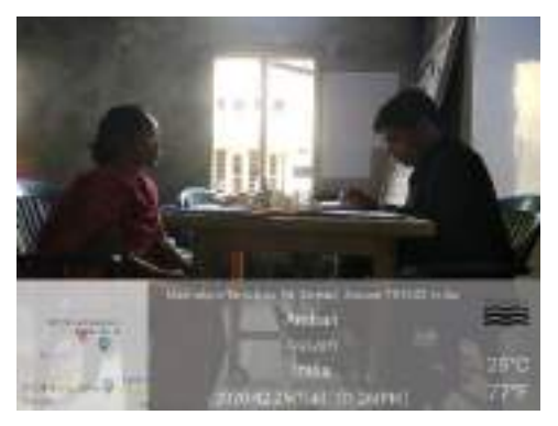
Viva Assessment of Plumber trade