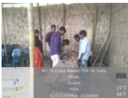
Practical Assessment of Carpenter trade