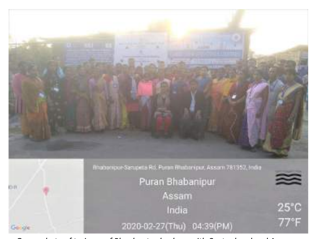
Group photo of trainees of Plumber trade along with Centre head and Assessor