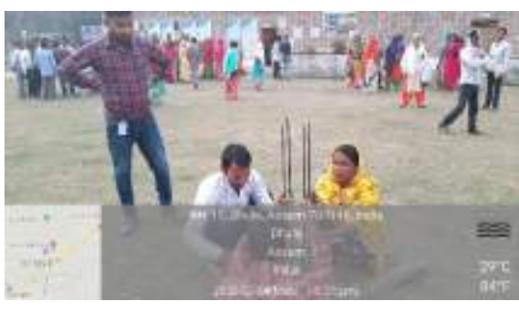
Practical Assessment of Bar Bending B trade