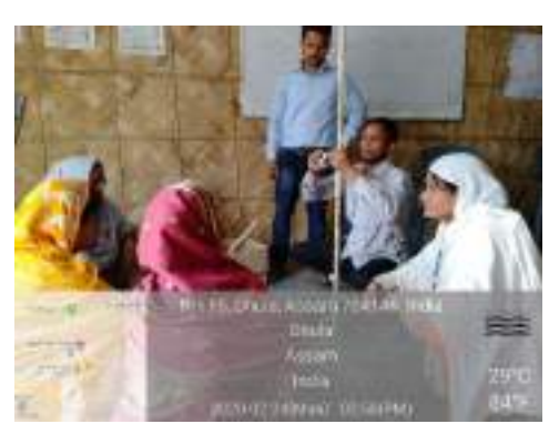
Practical Assessment of Plumber trade