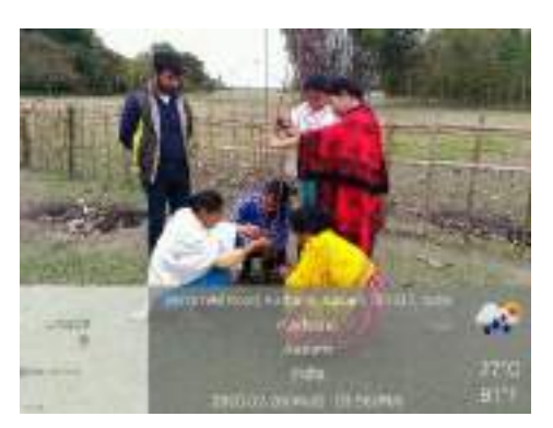
Practical Assessment of Bar Bending trade