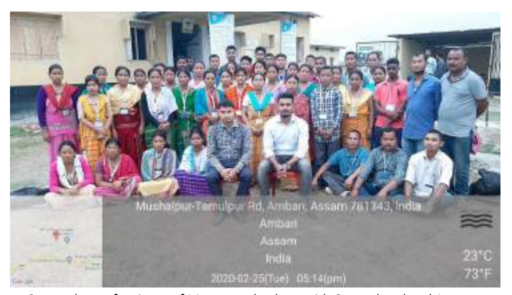
Group photo of trainees of Mason trade along with Centre head and Assessor