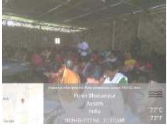
Theory Assessment of Bar Bending A trade