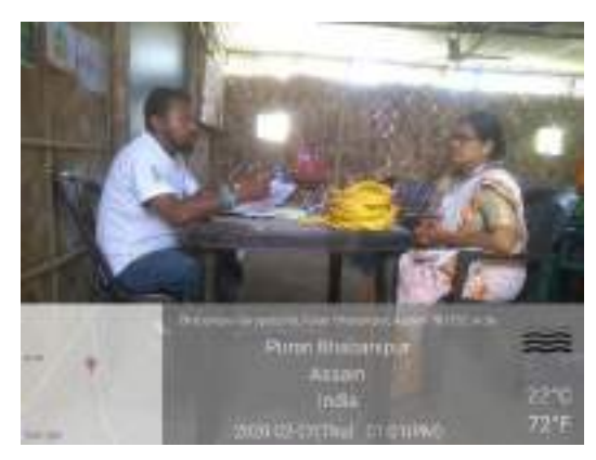
Viva Assessment of Bar Bending A trade