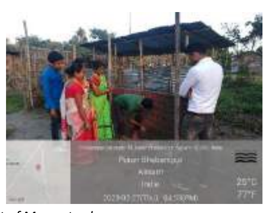
Practical Assessment of Mason trade