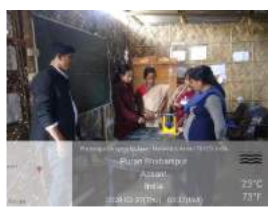
Practical Assessment of Plumber trade