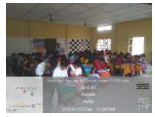
Theory Assessment of Painter trade