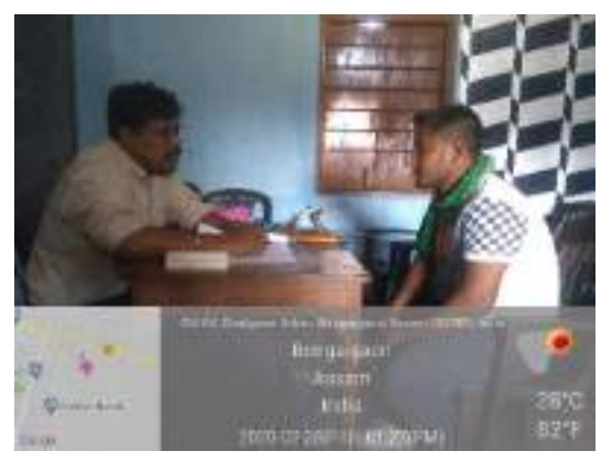
Viva Assessment of Carpenter trade