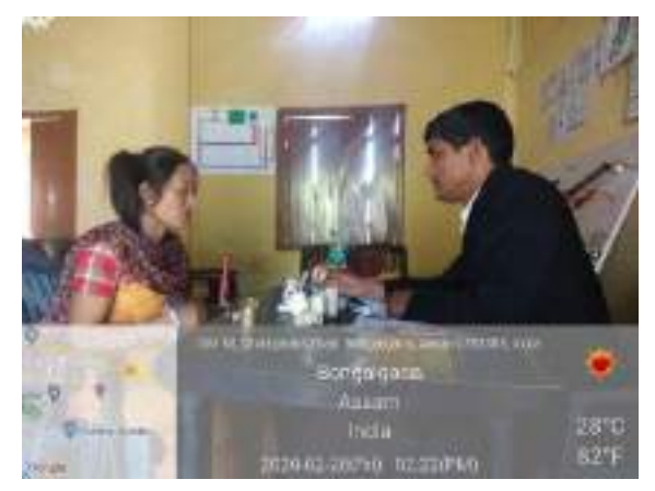
Viva Assessment of Plumber trade