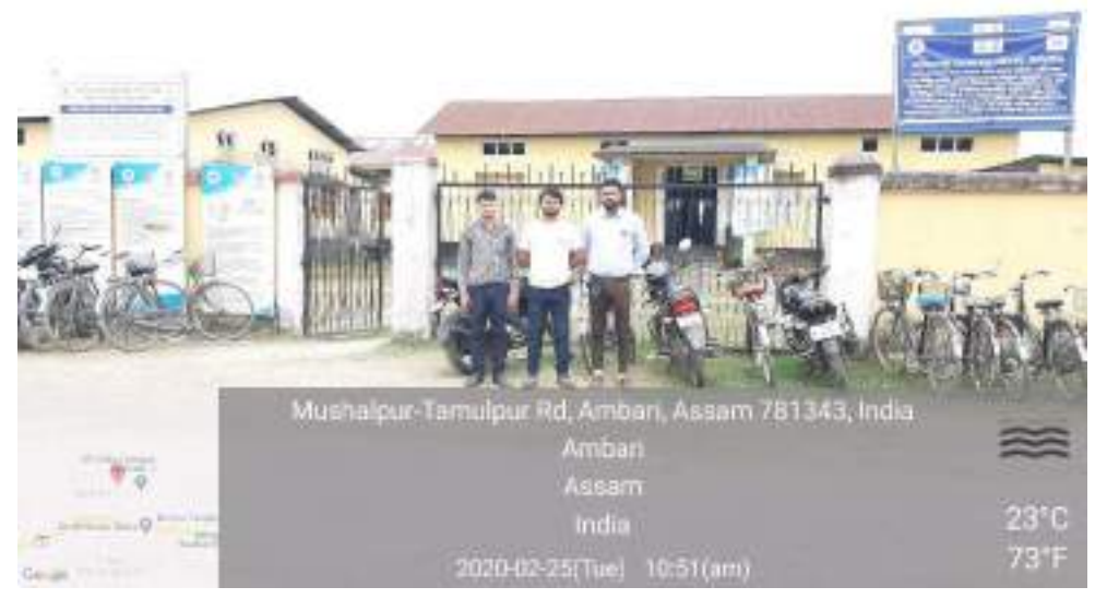
Diganta Kalita with Assistant and SPOC of the training centre with name of board of the training centre in the background