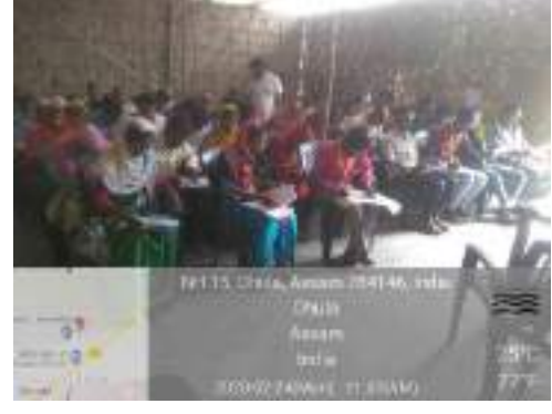
Theory Assessment of Mason trade