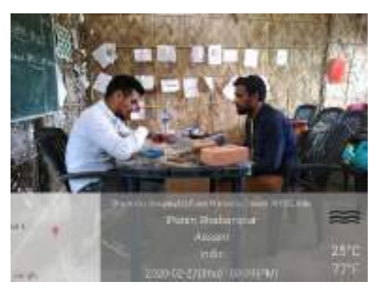
Viva Assessment of Mason trade