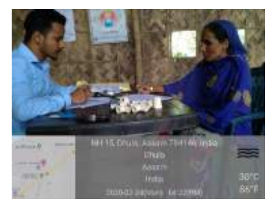
Viva Assessment of Plumber trade