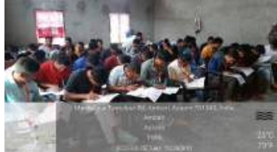
Theory Assessment of Electrician trade